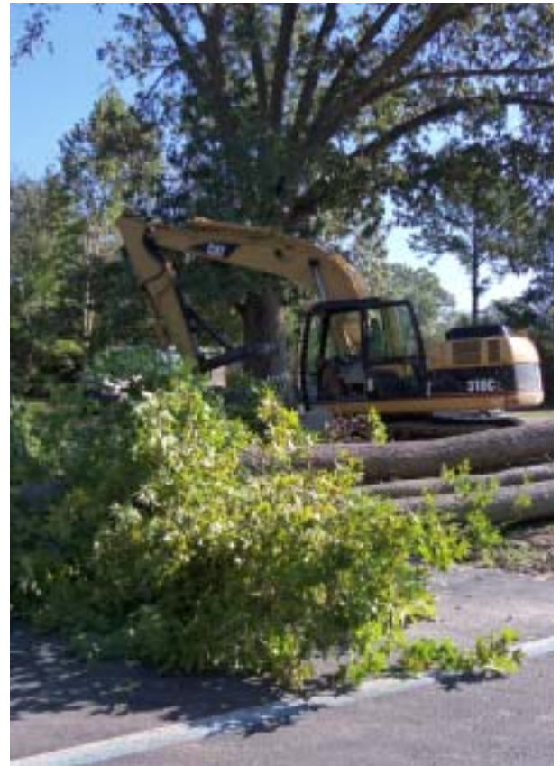
Construction on the addition to the Suffolk Children's Center began in October of 2011 with demolition.

The Children's Center applied to the U.S. Department of Health and Human Services for expanded EHS services after reviewing the community need.