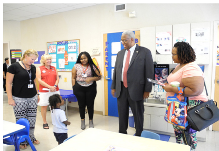
Representative Donald McEachin visited the Suffolk Head Start Center to meet with staff, children, and parents.