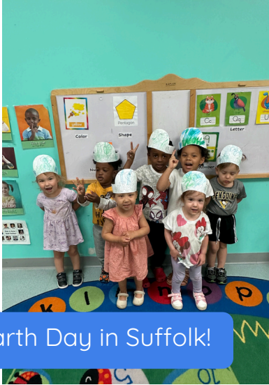
Earth Day in Suffolk!