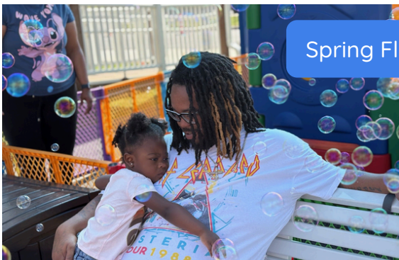
Spring Fling in Suffolk!