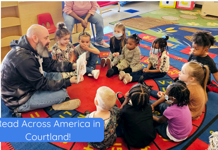
Read Across America in Courtland!