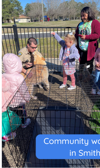
Community workers week in Smithfield!