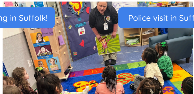
Police visit in Suffolk!

All classrooms are implementing the STREAMin3 curriculum and children are enjoying the interactive activities! This curriculum is funded by the Obici Healthcare Foundation and the Virginia Department of Education.